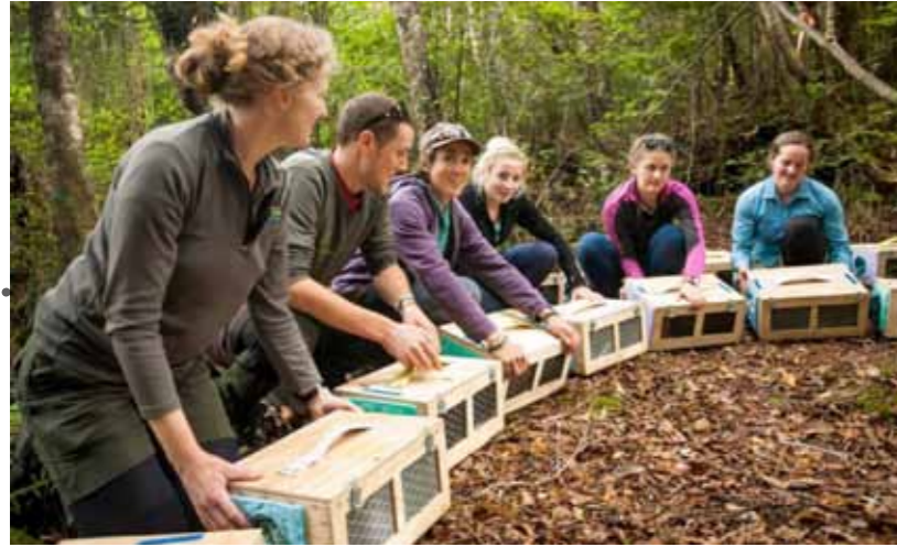
On the count of three...

In defiance of all the theory though, the latest word is that one of the toutouwai has impatiently skipped straight to stage b, having been spotted on nearby Long Island recently.