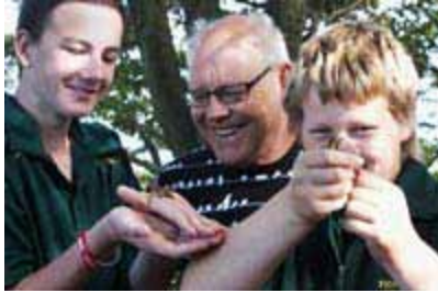
Some of the 'Kids' on the project