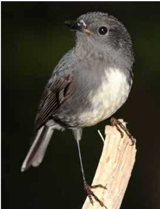
Kakarua/South Island robin